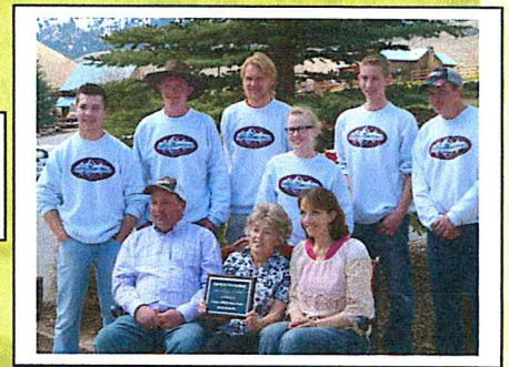
Rigby High School Spirit of Envirothon Award