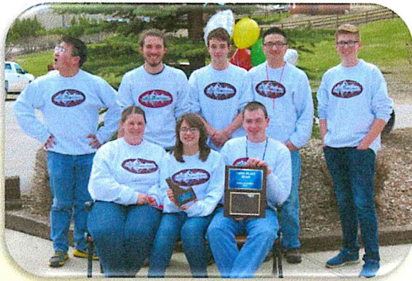
1 st Place Team Skyline High School Sponsored by: West Side SWCD Team Members:

This year's Idaho Envirothon's winning team for 2017 is Skyline High School sponsored by the West Side Soil and Water Conservation District. Skyline attended for their second year coming back strong after a close race at the 2016 event. The team will represent Idaho at the 2017 National Conservation Foundation Envirothon competition in Emmitsburg, Maryland. The NCF event, featuring teams from throughout the United States and Canada, will be held July 23 – July 29 at Mount St. Mary's University. The Idaho Envirothon is excited to send this team to represent Idaho and congratulates Skyline on their win.