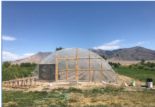
Seasonal High Tunnel, EQIP Seasonal High Tunnel Initiative contract

The NRCS obtained 43 new contracts, benefiting 45,771 acres and provided $1.6 million financial assistance for landowners. Contracts were obtained in the Sage-Grouse Initiative, general EQIP, general CSP, WaterSmart, Grassland Conservation Initiative CSP, and Natural Disaster categories