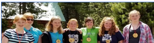
Natural Resource Camp attendees

A special thanks for the Idaho Soil and Water Conservation Commission for providing Capacity Building funds to help sponsor District activities and workshops