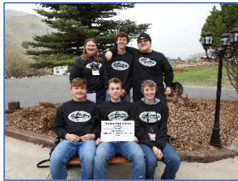
Mackay Public School Envirothon Team