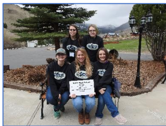
Butte County Envirothon Team