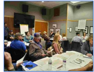
Local Work Group Meeting

Tour, provided outreach information and educational activities at county fairs and farmer’s markets, provided scholarships for seven students to attend Natural Resource Camp, created pollinator seed packets for distribution, and sponsored a speech