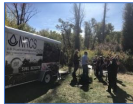
6th Grade Natural Resources Tour