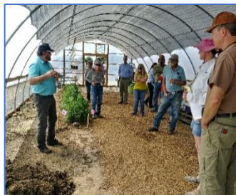
High Tunnel Informational Meeting

seasonal high tunnels. The meeting resulted in several applications for the NRCS’ Seasonal High Tunnel Initiative.