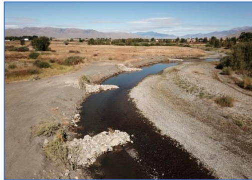
Rock riprap to reduce erosion, EQIP contract