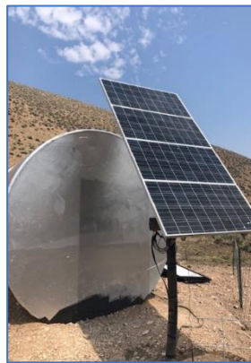
Solar powdered pump and water storage tank, EQIP Sage Grouse Initiative contract