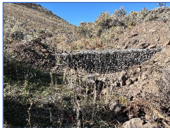
NRCS funded gabion baskets in Butte County