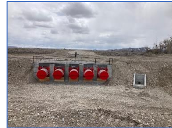
Fish Screens installed with District grant