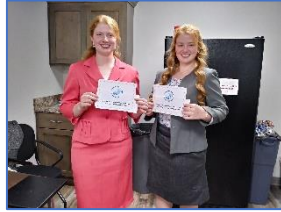
Speech Contest Winners