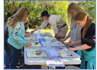
6 th Grade Natural Resources Tour

Foundation was used to conduct research on reducing evaporation in stockwater tanks.