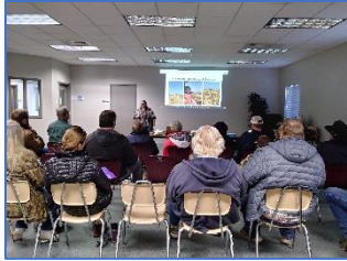
Educational public meeting

The NRCS obtained 54 new contracts, benefiting 38,704 acres and provided $6.8 million in financial assistance for landowners. Contracts were obtained in the general EQIP, general CSP, and Regional Conservation Partnership Program-EQIP programs.