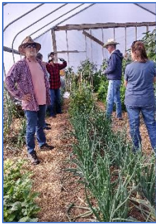
Annual Conservation Tour